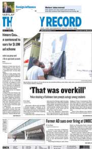
( https://thedailyrecord-md.newsmemory.com/ )